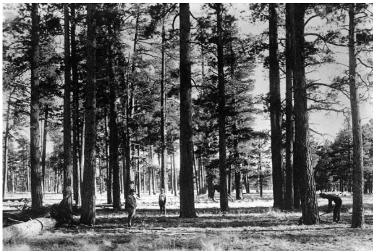
Ponderosa pine forest near Flagstaff, early 1900's. Note open structure and herbaceous understory.

Over 150 years of occupancy by northern Europeans has markedly changed vegetative conditions in the Southwest. Less fire due to grazing and fire suppression triggered a shift to forests with very high tree densities, which in turn contributed to destructive forest fires. Options to deal with these changes include prescribed fire, thinning and timber harvest to mimic natural disturbances and conditions. However, there are barriers to implementing these activities on a scale large enough to have a significant benefit.